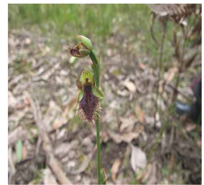
Purple Beard Orchid- growing in local Lowland Forest of which only 23% remains