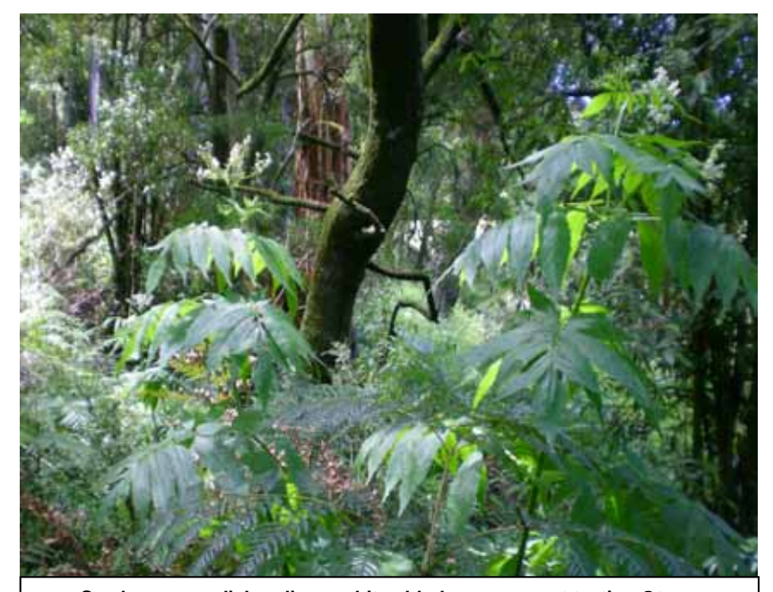
Sambucus gaudichaudiana- white elderberry, a sweet tasting Otway perennial bush food and important bird habitat plant

may seem like small beer, but when 160,000 plants are grown, the numbers add up considerably.